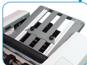
Clearly marked fold plates are easy to adjust