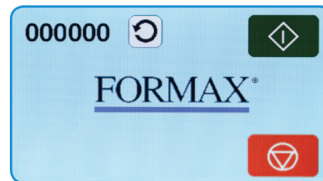
Touchscreen control panel is graphics-based making it easy to use