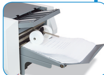
Integrated output conveyor keeps processed forms neat and sequential